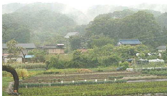
Figure 4 A rainy scene of Kawaguchi Village

Kawaguchi Village has beautiful scenery because it has beautiful nature such as green hills, clean rivers and fertile fields. The landscape of Kawaguchi Village in a rainy day during the rainy season of the Japanese islands is particularly beautiful and heartwarming (Fig. 4). In early spring, we can enjoy many beautiful plum blossoms and cherry blossoms. The cherry trees are the representative plant of Japan. One hundred years ago, a famous Japanese poet, Toukoku Kitamura, visited Kawaguchi Village and stayed there for a short time. He wrote the novel entitled, Mikka-Genkyo , which means "the stay for three days in Fantastic village Kawaguchi."