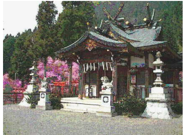
Figure 2 The Imakuma Shrine

a hero in an animated film made by the very famous Japanese animated movie director, Mr. Hayao Miyazaki, and lives in the forests in the Sayama Hill region of Tokorozawa city, Saitama Prefecture.