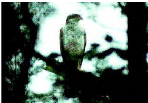
Figure 5 A Japanese hawk, Otaka, in Tengo-mine Forest

future because the bird is one of the endangered species in Japan.