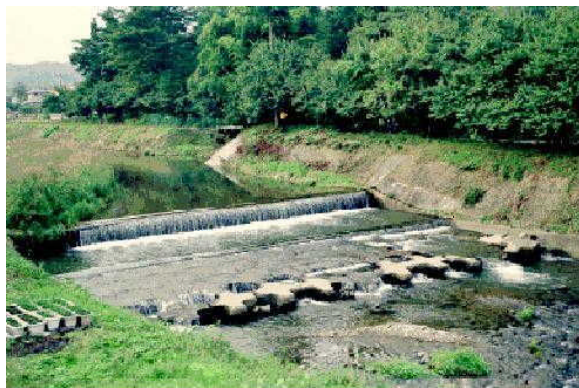
Figure 3 Kawaguchi River