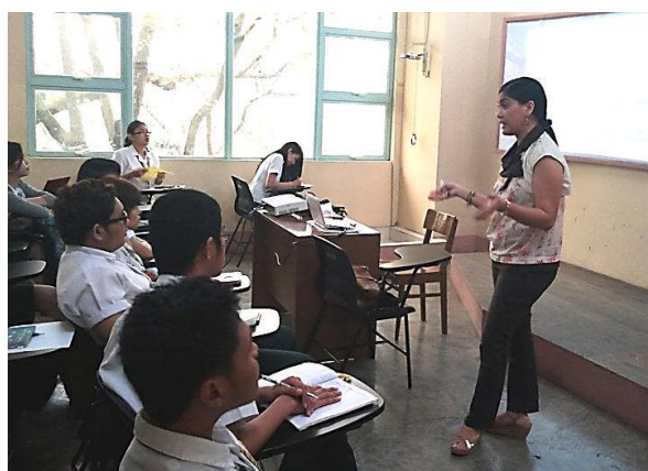
Figure 1 A guest lecturer from one university delivered a lecture on a specified topic

the students to assess whether the activity would be effective. The students are informed about conducting the post-survey prior to the lecture. Consents to the survey are given by the students prior to the learning activity. No points on grades are given to students for their answers to these evaluation forms.