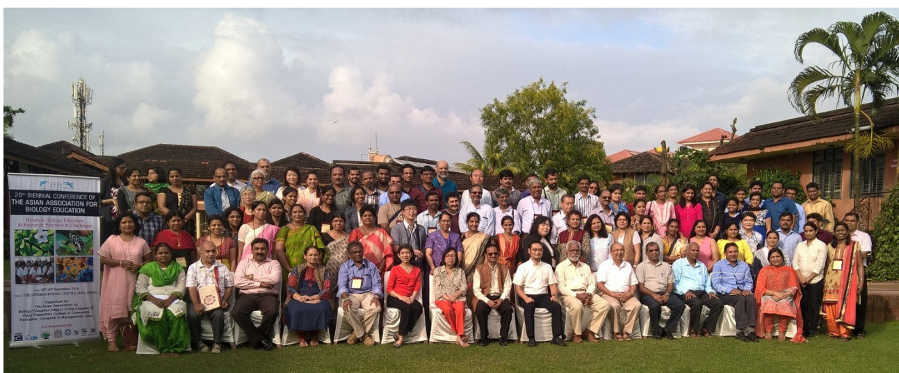
The attendants of the AABE26

The Book of the Abstracts of Papers was published and provided to the attendants of the conference. The following abstracts are reprinted from the book.